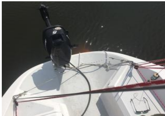
Snap hooks attached - one to each backstay pad eye