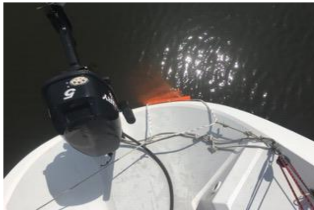
Ladder (orange image) in place on port side of transom

Remove the ladder from the bag and install it on the port side of the transom by clipping the two snap hooks, one each to the backstay pad eyes. Note that the attachment lines are of different lengths; attached the short line to the port pad eye and the longer line to the starboard pad eye.