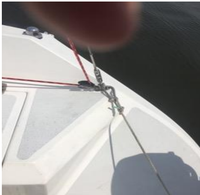
Long line snap shackle attached to starboard backstay pad eye

As the person comes up the ladder, offer assistance in getting him/her from the ladder onto the boat.