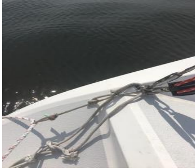
Short line with snap hook attached to port backstay pad eye